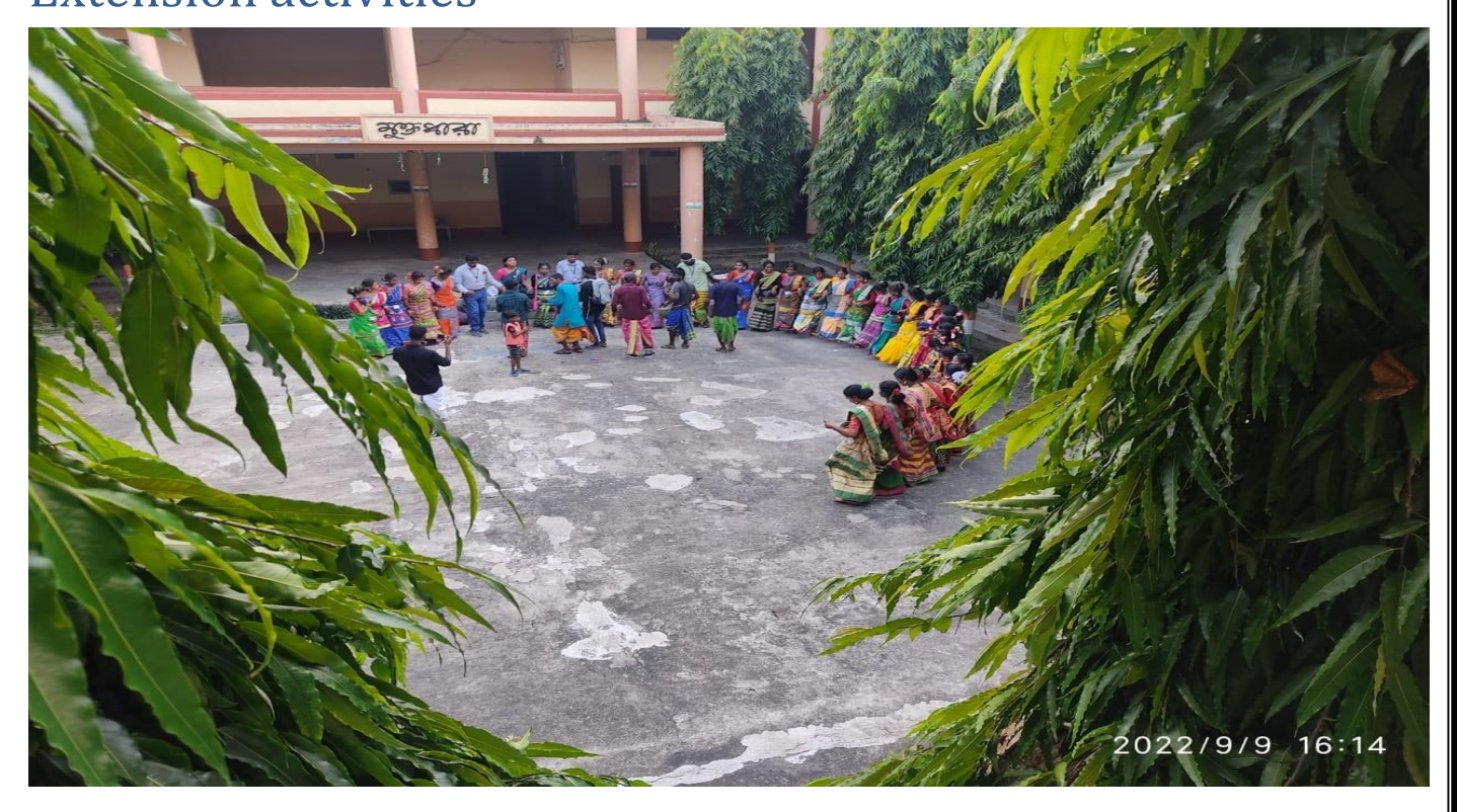
Santali Traditional Dance by Our Student